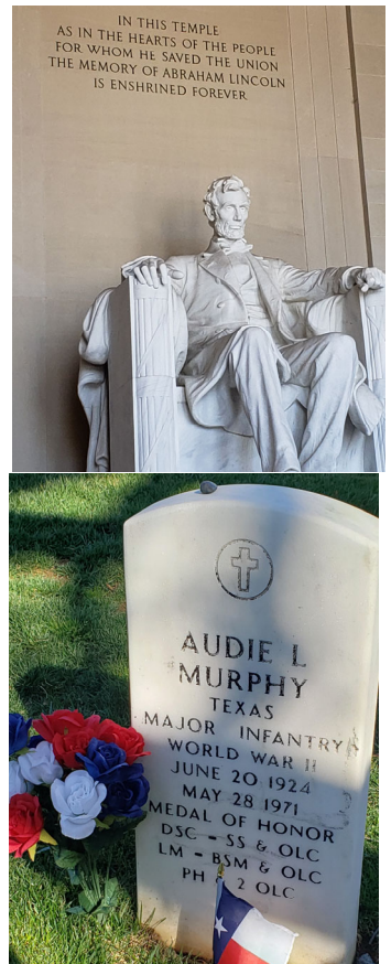
YES! He is laid to rest at Arlington National Cemetery