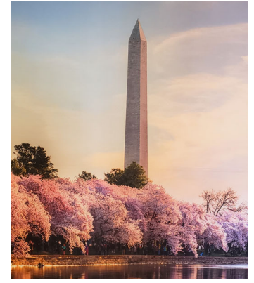
So glad we got to see the famous Cherry Blossoms!